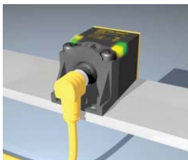
A quick-disconnect sensor and cordset combination.

EMI/RFI can interact with sensing elements, causing the sensor to lock on or "chatter". Noise emitting devices can range from two-way radios to motors and drives, so the likelihood that a sensor will be exposed to EMI/RFI is relatively high. This will only increase as the use of wireless communication increases. Several sensors have been designed for noise immunity, including Factor 1 sensors. If you use Factor 1 sensors you shouldn't have to stock both these and noise-immune sensors.